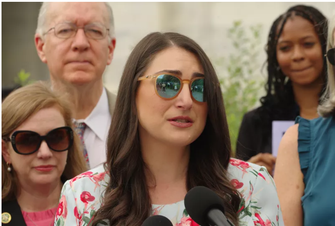
WASHINGTON, DC - June 4, 2024: U.S. Rep. Sara Jacobs (D-Cal.) speaks at a press conference announcing a discharge petition for the Right to Contraception Act in the House of Representatives.

( https://www.lgbtqnation.com/tag/good-news/ )