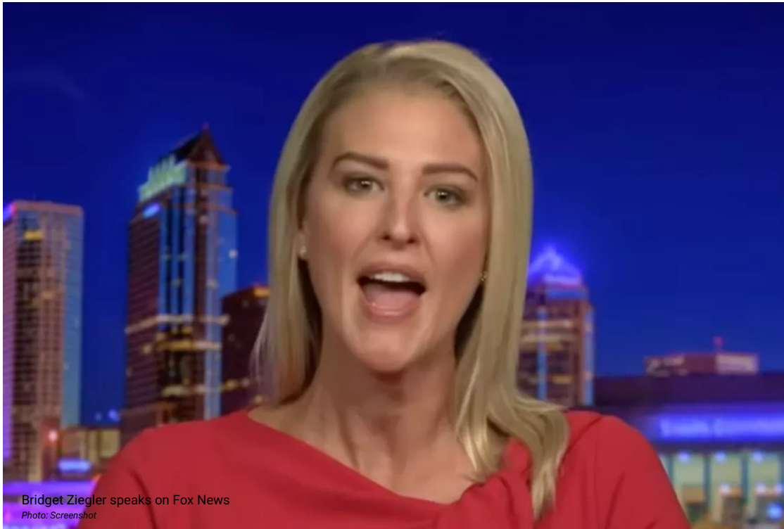
Bridget Ziegler speaks on Fox News Photo: Screenshot

By Molly Sprayregen (https://www.lgbtqnation.com/author/mollysprayregen/) Monday, December 4, 2023