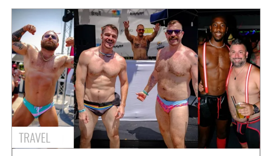
50+ Woof-Worthy Pics From Provincetown Bear Week 2023