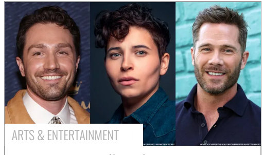
9 LGBTQ+ Hallmark Stars You Should Know