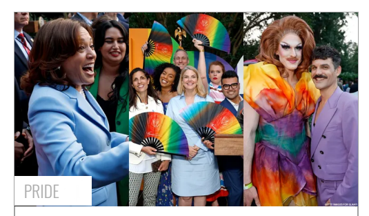
63 Photos of Kamala Harris's 2023 Pride Month Celebration