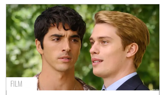
Red, White, & Royal Blue's Steamy, Sexy, & Adorable Trailer Is Finally Here