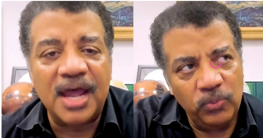
Neil DeGrasse Tyson boldly defended trans women in sport in a recent debate.

Astrophysicist and science educator Neil deGrasse Tyson boldly stood up for transgender women in sport in a recent debate, warning that one day this issue “will look completely ridiculous.”