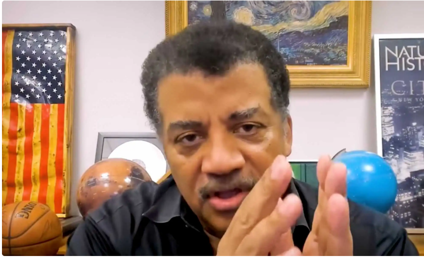
Neil DeGrasse Tyson has stood up for transgender women in sport.

The astrophysicist replied: “We’re in a transitional period. So we have to figure that out. But the way to figure out things that require solutions to progressive change is not to regress it to how things once were. If that were the case, I would still be drinking from a segregated water fountain.”