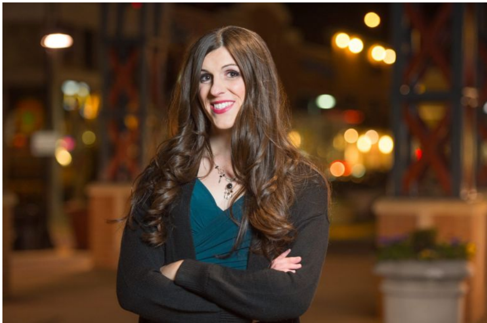
VA Sen. Danica Roem.

(WB )Virginia state Sen. Danica Roem (D-Manassas)'s Republican opponent in her state Senate race continues to highlight his opposition to transgender rights.