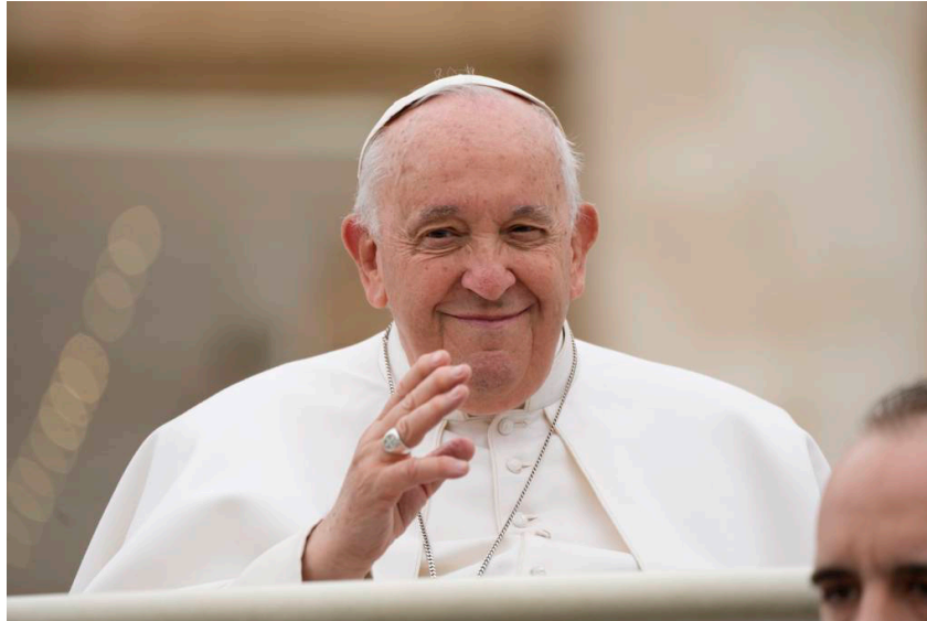
Pope Francis waves at the end of his weekly general audience in St. Peter's Square at the Vatican on May 3, 2023.

In January, Francis denounced laws criminalizing same-sex relationships, saying “being homosexual isn’t a crime,” adding that “we are all children of God.”