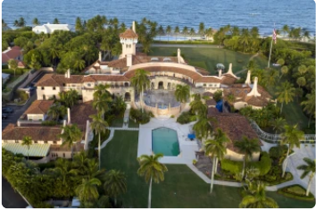
Trump faces new charges in documents case