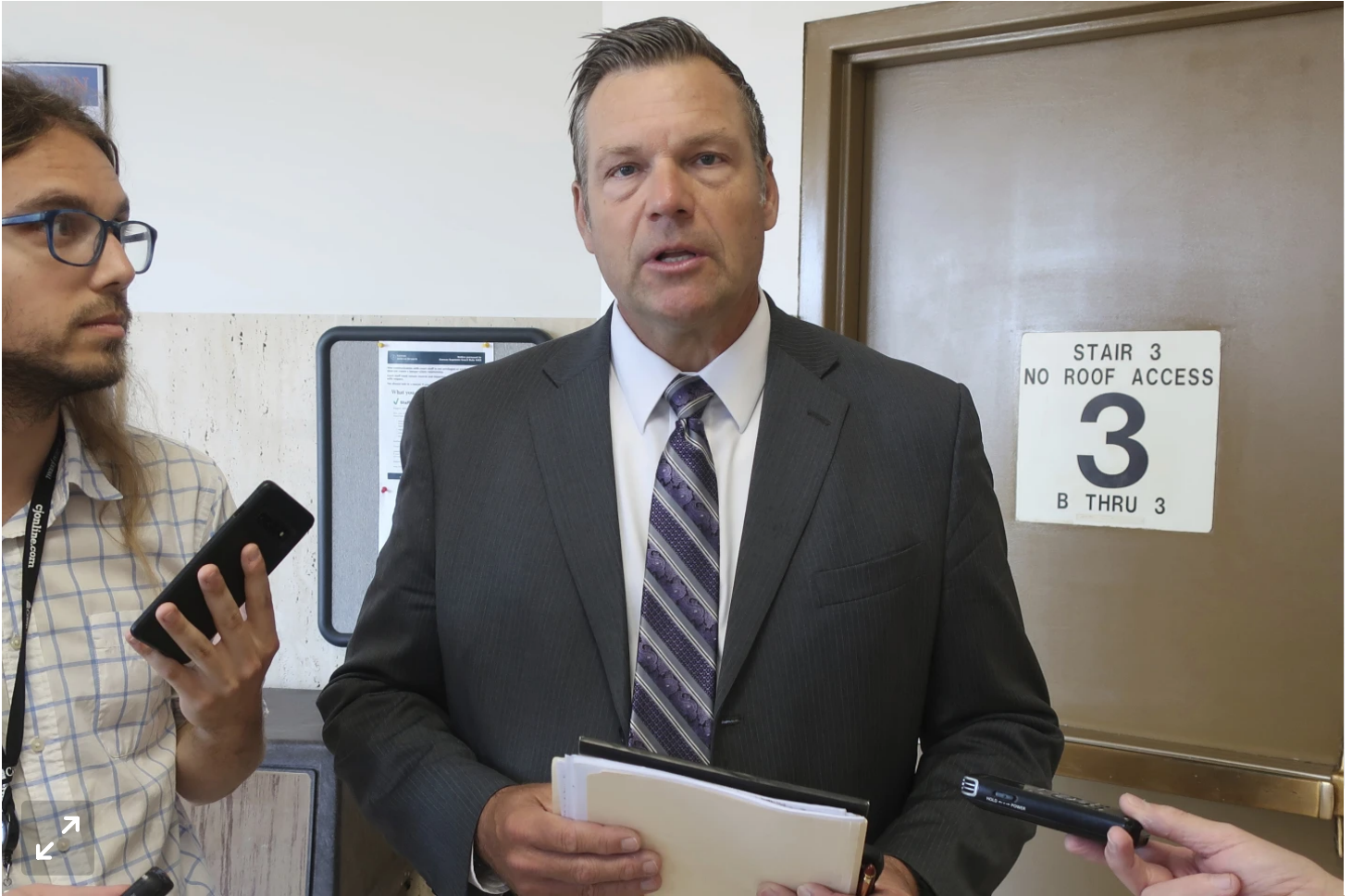
1 of 3 | Kansas Attorney General Kris Kobach speaks to reporters following a hearing in his state-court lawsuit against the state allowing transgender people to change the sex listing on their driver's licenses, Thursday, Ji