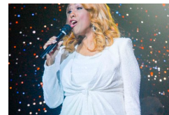
The White Diamond: All White Party