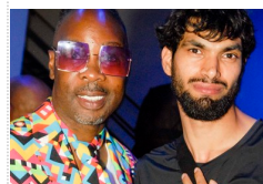
Capital Pride Honors