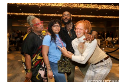
DC Black Pride: Talent Showcase