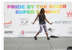
Pride By the River Super Sunday