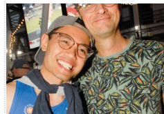
Team DC's Night Out at Nationals Park