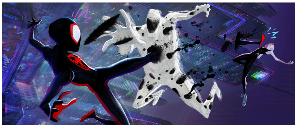
Miles Morales (Shameik Moore) and Gwen Stacy (Hailee Steinfeld) take on The Spot (Jason Schwartzman)

The computer-animated action film Spider-Man: Across the Spiderverse will not be shown in theaters in the United Arab Emirates after failing the country's censorship requirements, as reported by Variety last week.