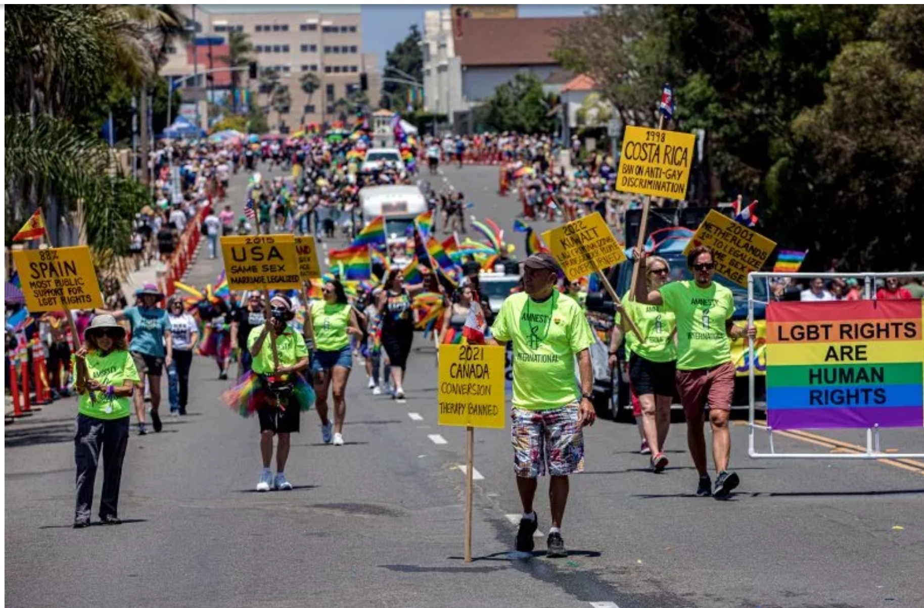
Participants march in the 2022 San Diego Pride Parade on July 16, 2022, in San Diego, California. The Human Rights Campaign, the nation's largest LGBTQ+ civil rights organization, on Tuesday issued the