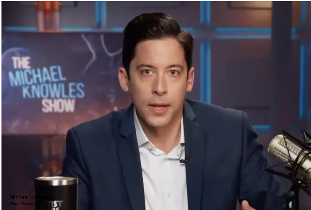
Michael Knowles