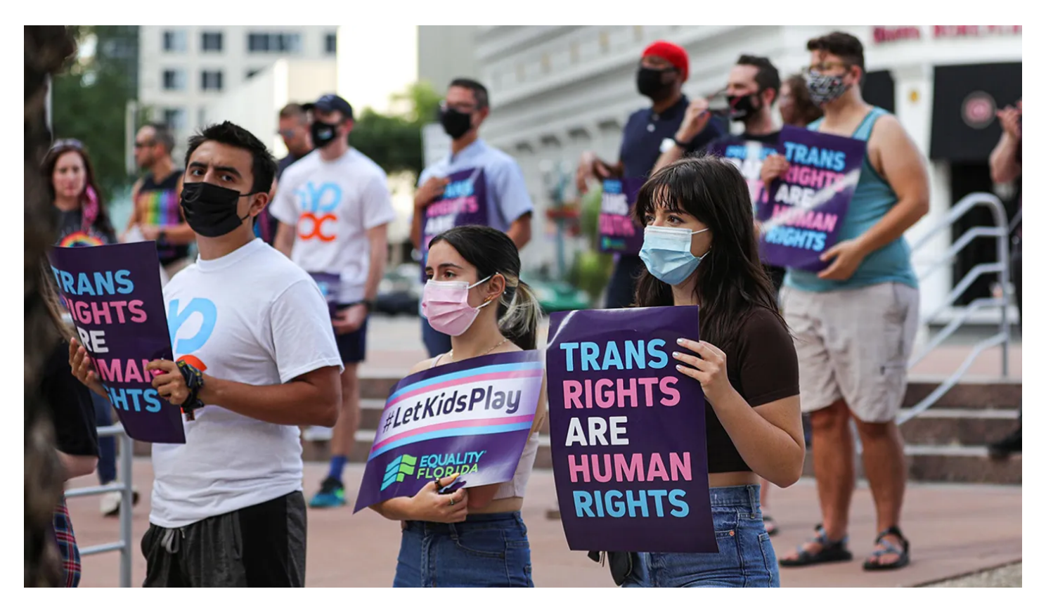
A group of attendees listens to a speaker during the #ProtectTransKids rally outside Orlando City Hall on June 1, 2021, in Orlando, Florida.