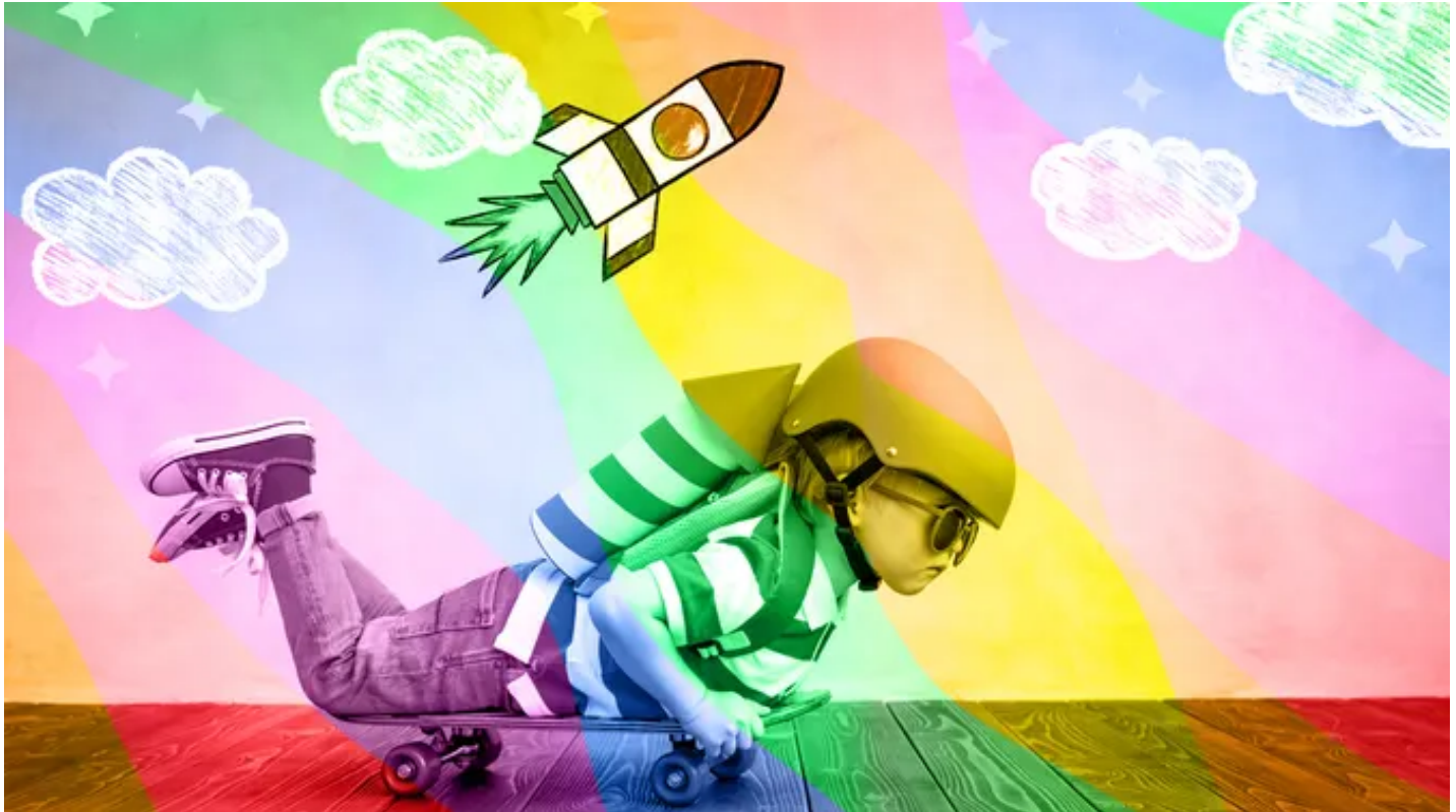
Kaiser Permanente training promotes transgender 3 and 4-year-olds.