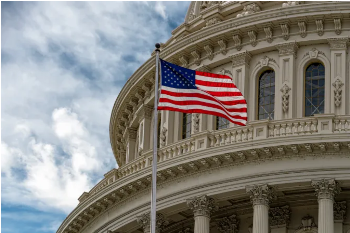
U.S. Capitol Building, Washington, D.C.