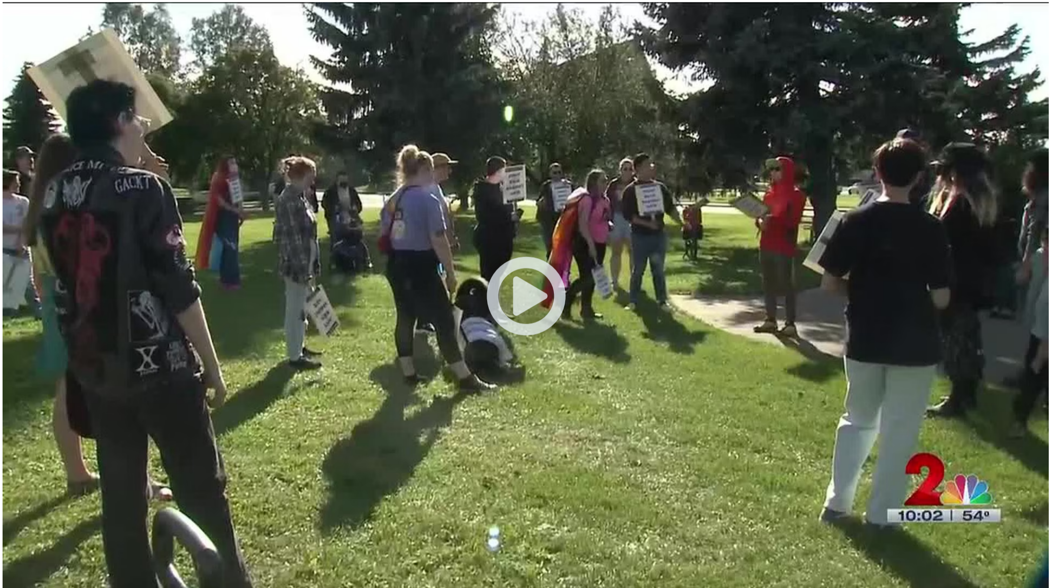
Protesters frustrated with Board of Education's vote to ban transgender athletes from girls' sports