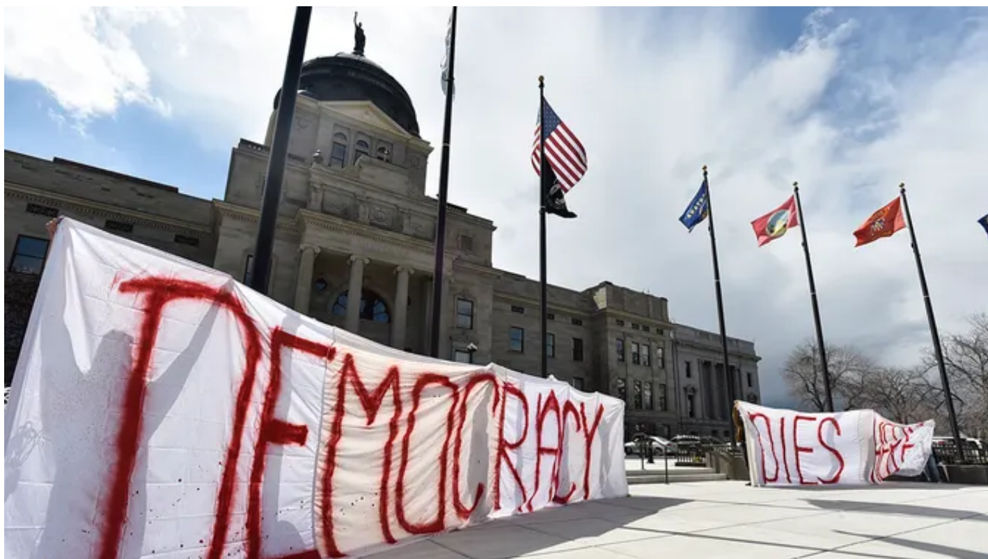
Demonstrators hold a sign that reads "Democracy Dies Here" on the steps of the Montana state Capitol, in Helena, April 24, 2023.