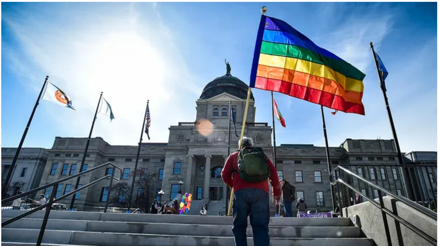
Demonstrators gather at the state Capitol protesting what they deemed "anti-LGBTQ+" legislation in Helena, Montana, March 15, 2021.