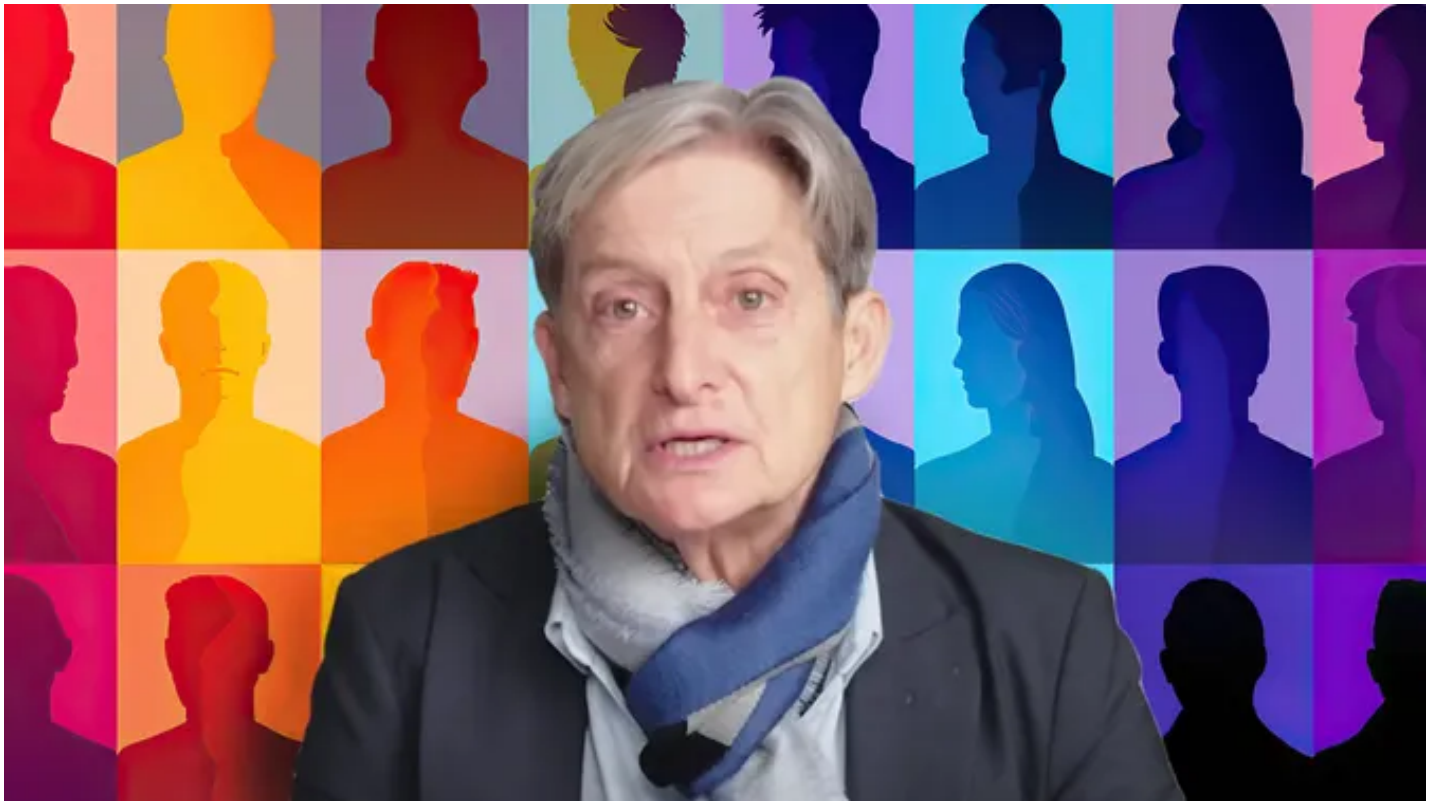
Judith Butler is a gender studies professor at Berkeley.

"When trans people started living openly, something changed in the world... Reality changed," she said.