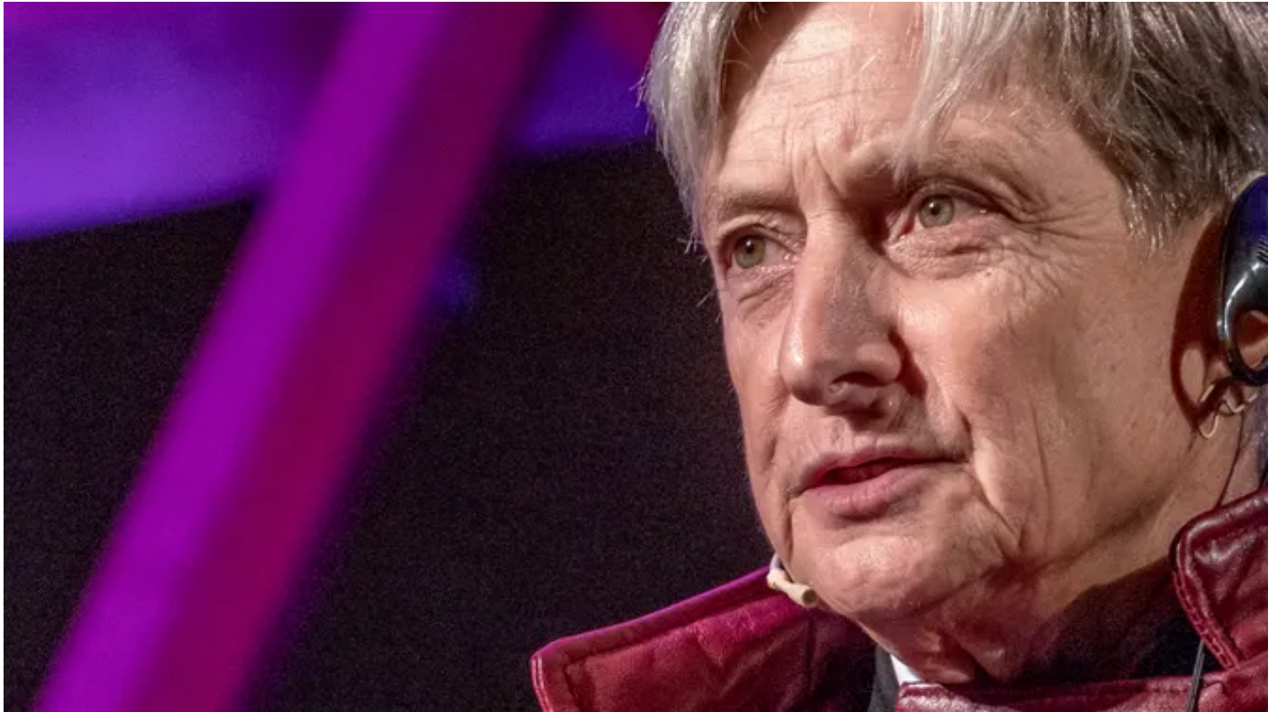
Judith Butler is a feminist gender studies professor at the University of California, Berkeley.

She proceeded to compare the language change around pronouns to racism against Black people.