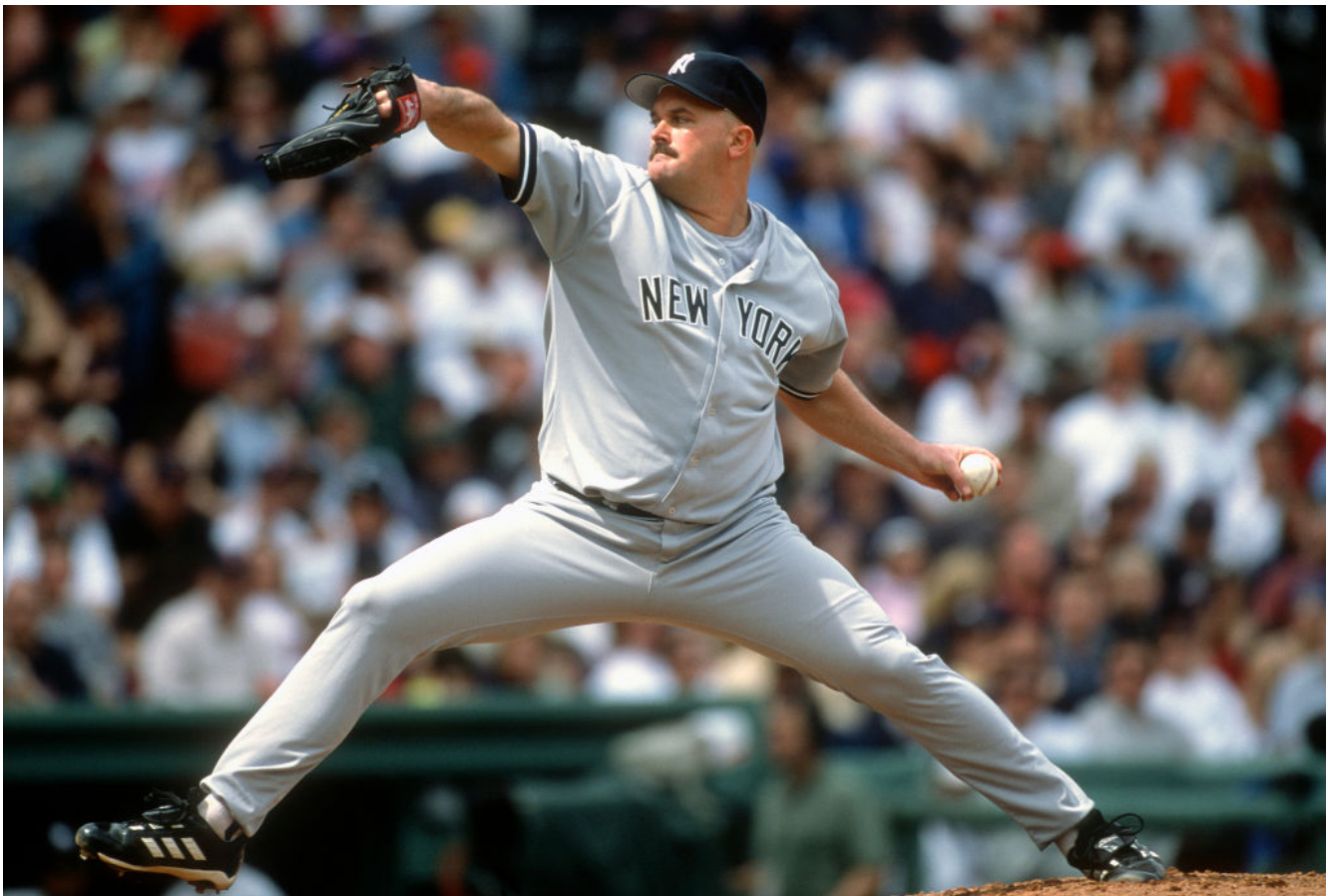
Former Major Leaguer David Wells — who threw a perfect game in 1998 against the Minnesota Twins — ripped companies trying to politicize sports.