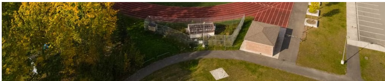
The athletic field at Begich Middle School on Saturday, Sept. 15, 2018.

A board appointed by Gov. Mike Dunleavy decided Thursday in favor of a new regulation that would ban transgender girls from participation in high school girls' sports.