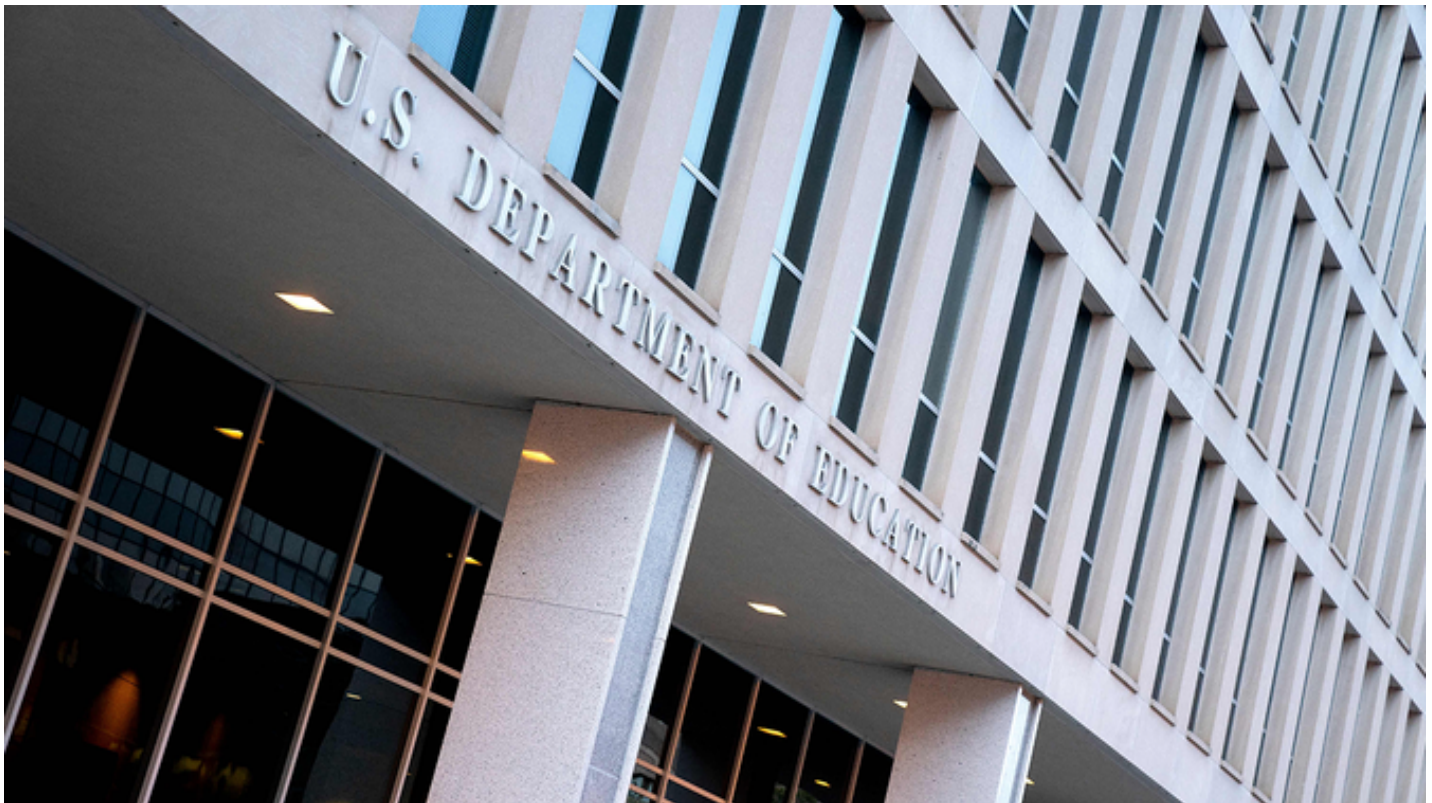
The U.S. Department of Education building in Washington, D.C.

Transgender participation in sports has become a flashpoint in the sports world and in the political arena as women sports advocates cite unfair biological advantages that help males dominate their female competitors. The issue has also raised safety concerns among parents of female athletes, who fear their children could sustain lasting physical injuries if forced to compete against stronger biological males.