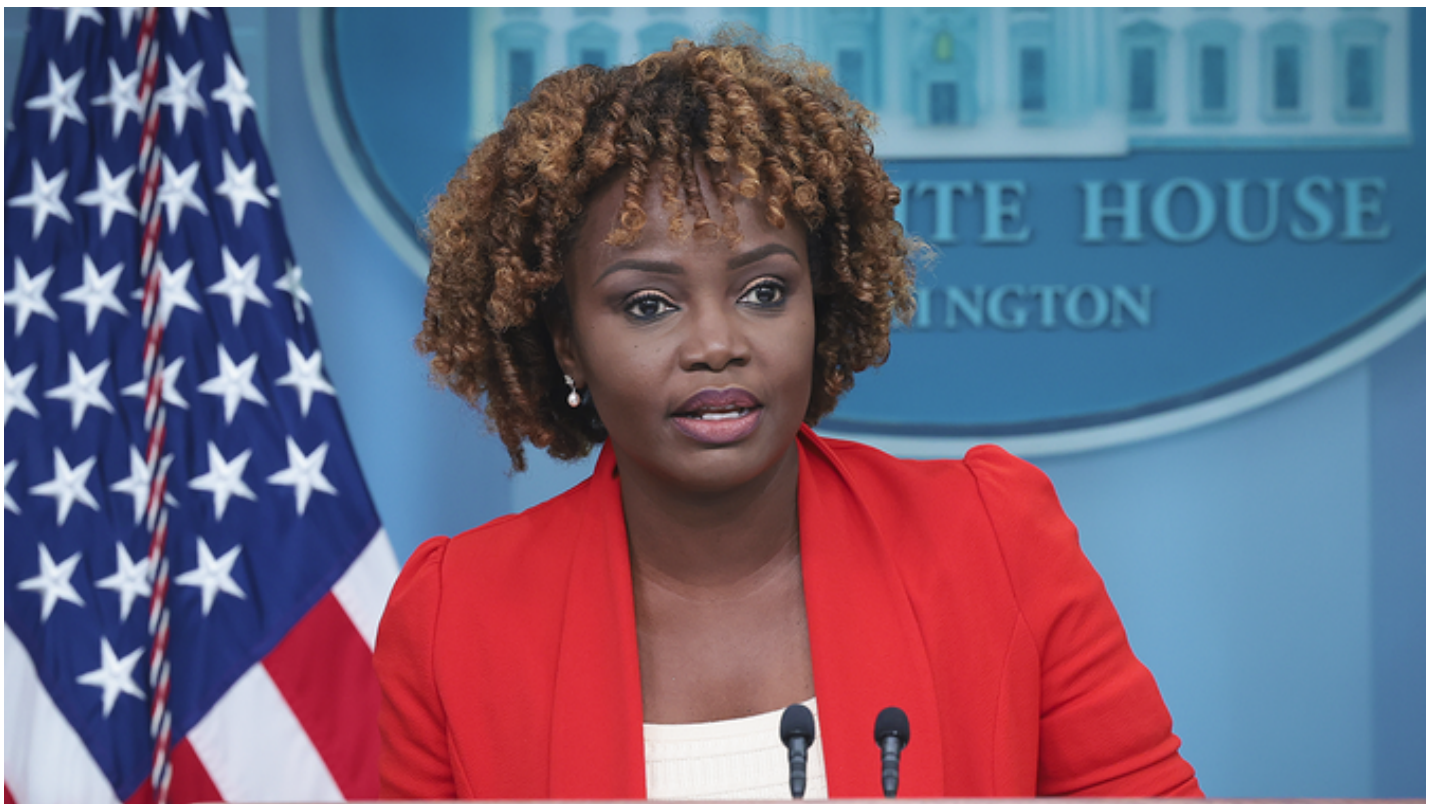
White House press secretary Karine Jean-Pierre speaks during the daily press briefing at the White House on Aug. 29, 2023.