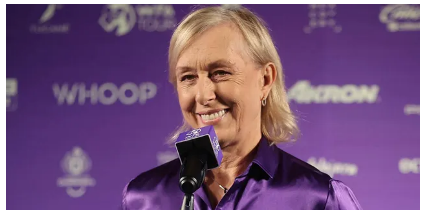
"Come on @USTA- women's tennis is not for failed male athletes- whatever age," Navratilova wrote on X.

"The player's total testosterone level in serum must remain below 10 nmol/L throughout the period of desired eligibility to enter into and participate in any <u>WTA Tournament</u>.