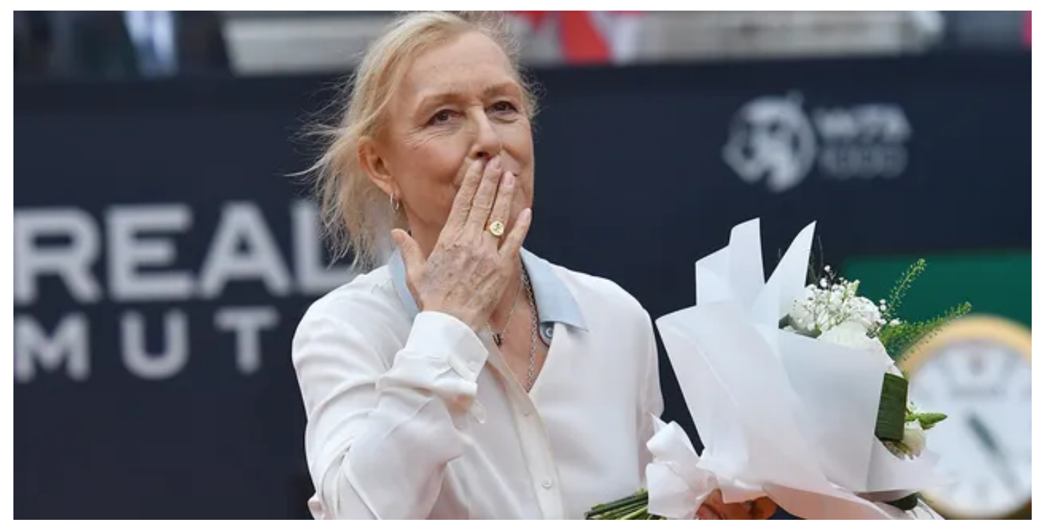
Tennis legend Martina Navratilova called out the United States Tennis Association transgender inclusion policy early Sunday morning in response to another post on social media.

"Those who transition from male to female are eligible to compete in the female category under the following conditions: