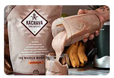
Surprising Results After Man Tries Popular Health Drink