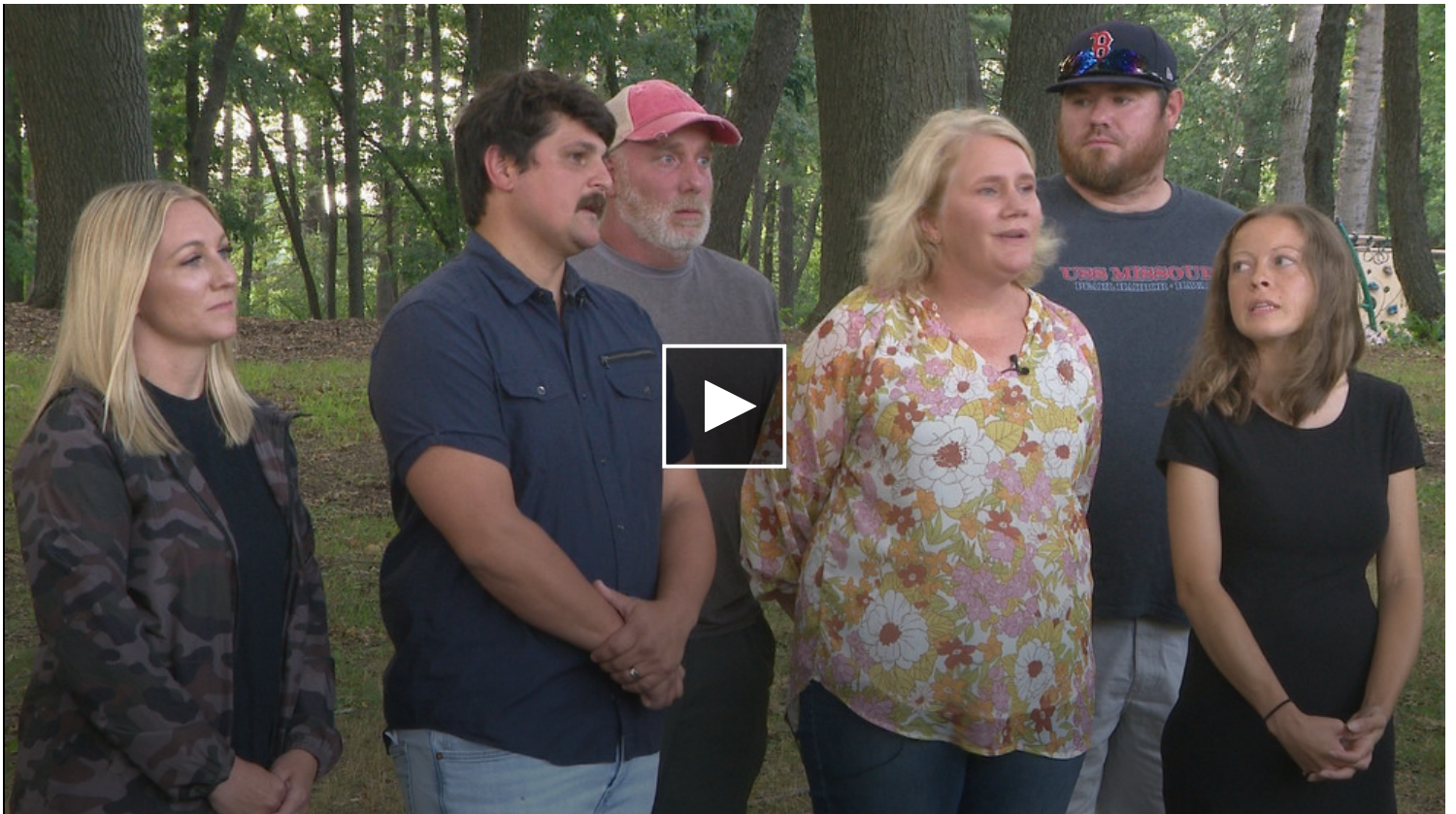
A group of Green Bay parents talks to FOX 11 about a transgender athlete potentially playing for a girls' sports team this fall.