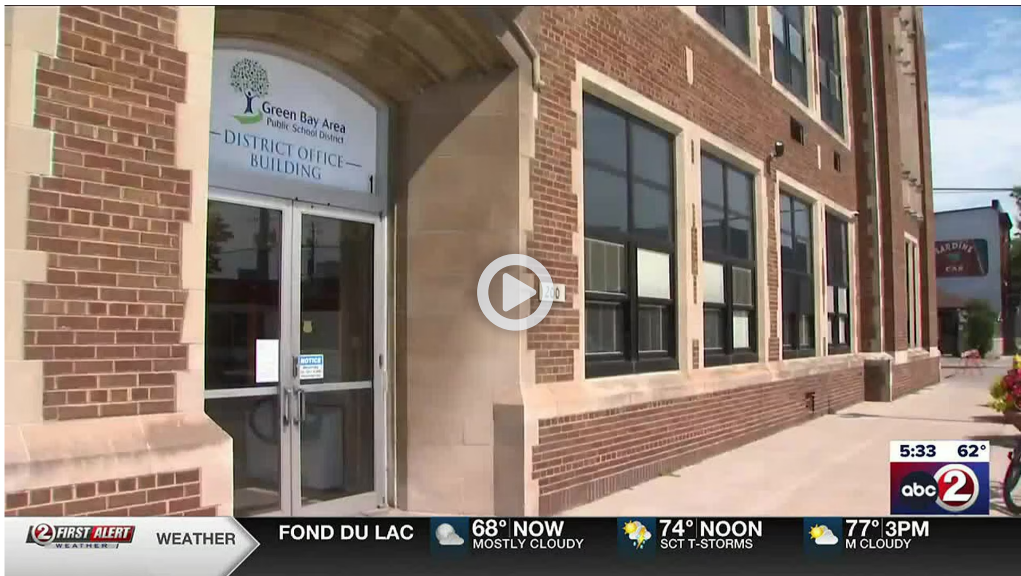
The school district held a meeting for parents to discuss the rules under Title IX and WIAA