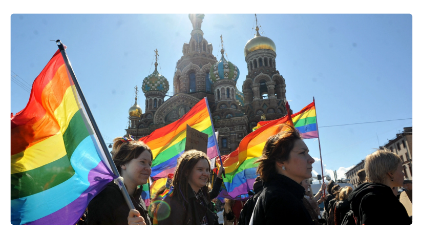
Vladimir Putin signs law banning all trans healthcare in Russia