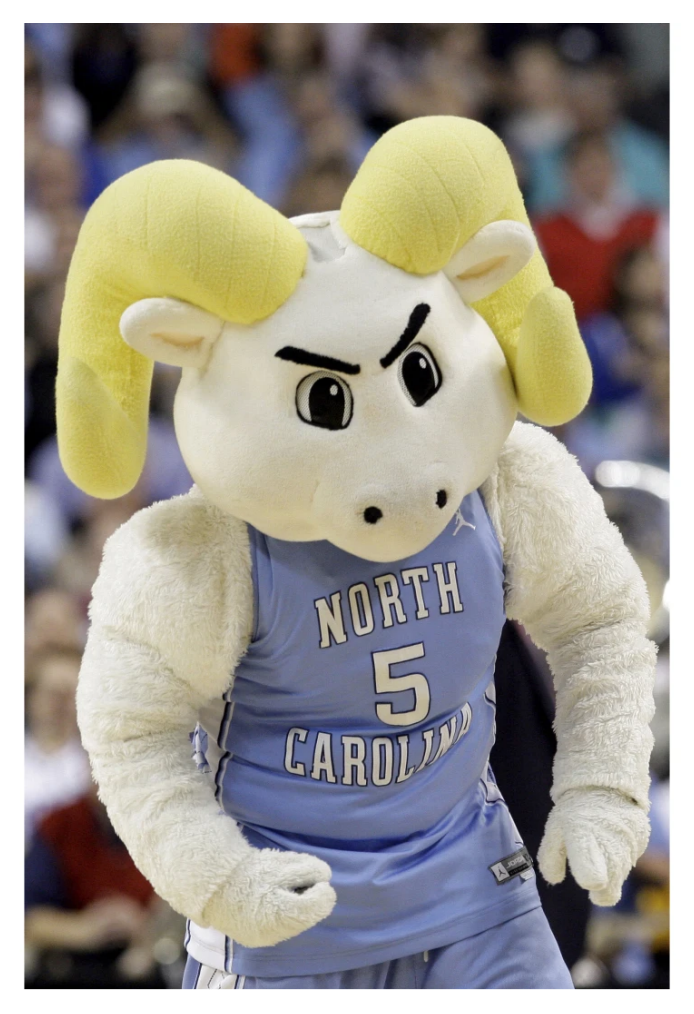
Basketball blue bloods North Carolina and Kansas schedule regular-season games for 2024 and '25