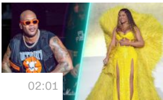
What it costs to book Beyoncé or Flo Rida for your party