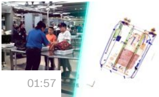
When will the US lift the liquid ban in airports?