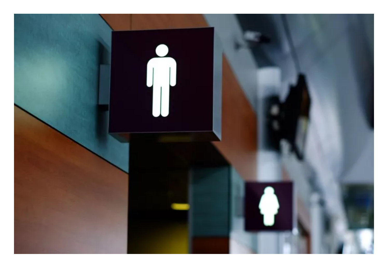
Public restrooms. On Tuesday, July 25, 2023, a woman in New Jersey filed a lawsuit against a movie theater after she was kicked out for taking her autistic son to the woman's restroom.