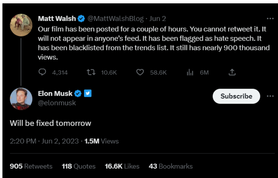
Screengrab of the tweet by Elon Musk

He also promised to fix the issue by June 3rd while responding to Matt Walsh.