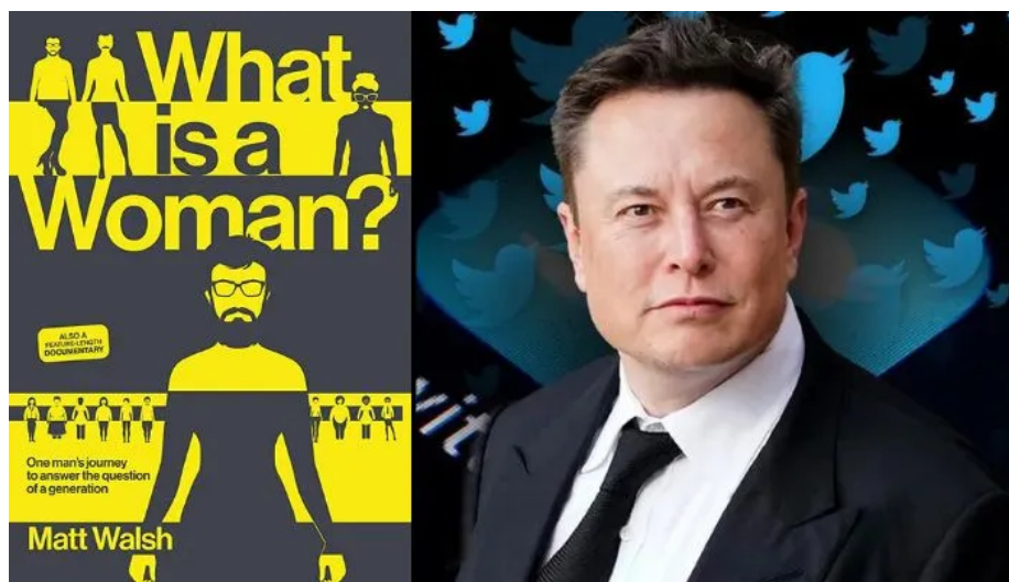
What is a woman documentary poster, Elon Musk