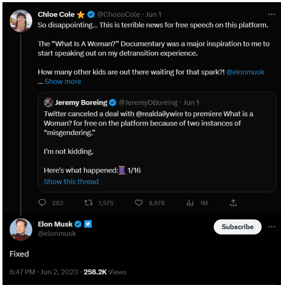
Screengrab of the tweet by Elon Musk

Later, she de-transitioned to become a woman. Chloe Cole is now fighting to protect minor children from undergoing gender transition surgeries.