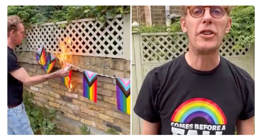
Laurence Fox burning Pride flags on Father's Day

Share Share Save for later Share Save for later