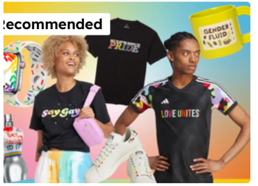
de Month 2023: all of the Inds releasing collections and oporting LGBTQ+ charities

uncover the best deals on tickets, fashion, beauty and more