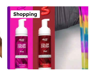
This temporary hair dye rang gives you a mini makeover ii just 10 minutes