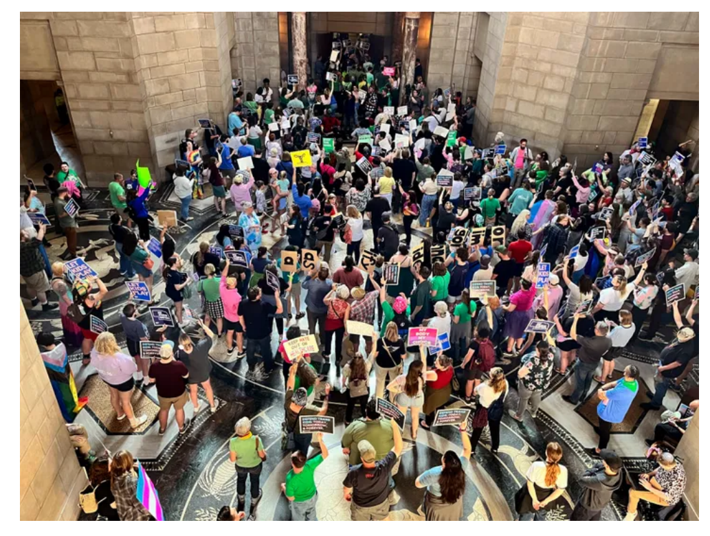
Hundreds of people descended on the Nebraska Capitol on May 16 to protest adding the abortion ban to the transgender health care bill.

The bill as originally written focused on prohibiting transgender people under 19 from having any gender confirmation surgeries. Though Republican lawmakers and conservative media have been raising alarms about such surgeries on minors, they are extremely uncommon. The bill also gives the state's chief medical officer — who is neither an elected official nor a specialist in transgender health care — the power to set regulations on the use of any puberty blockers or hormone treatments for that age group.