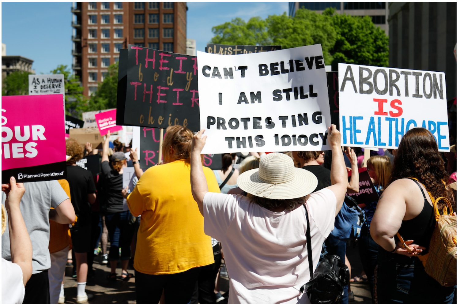
📷 Hundreds gather at a rally to support abortion rights at the Ohio Statehouse, Columbus, Ohio.