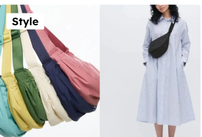
Everyone is buying this Uniqlo crossbody bag for the same reason