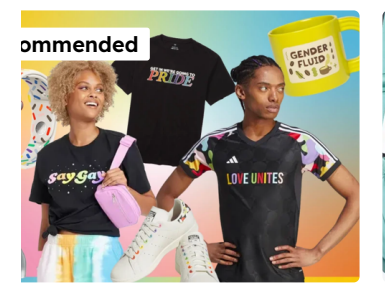
Month 2023: all of the is releasing collections and orting LGBTQ+ charities

ncover the best deals on tickets, fashion, beauty and more