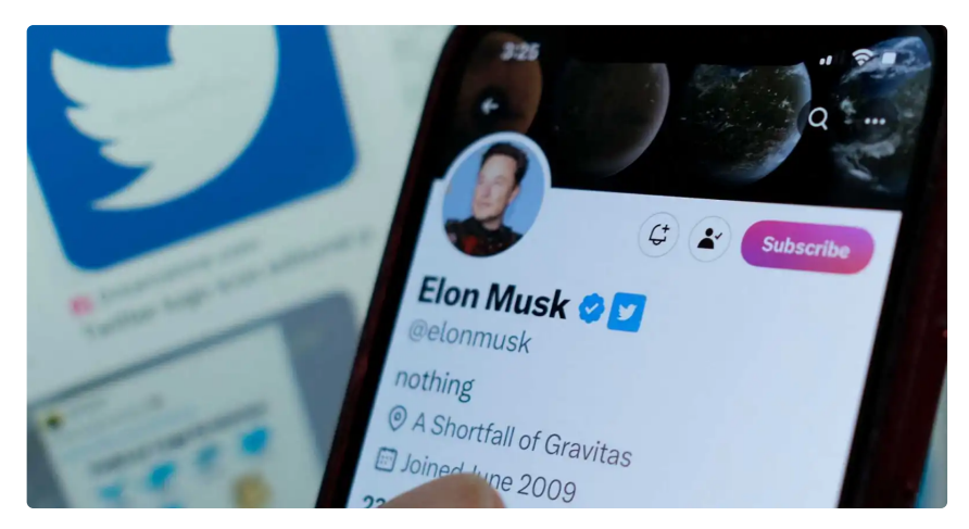
Elon Musk has said 'cis' and 'cisgender' are slurs on Twitter