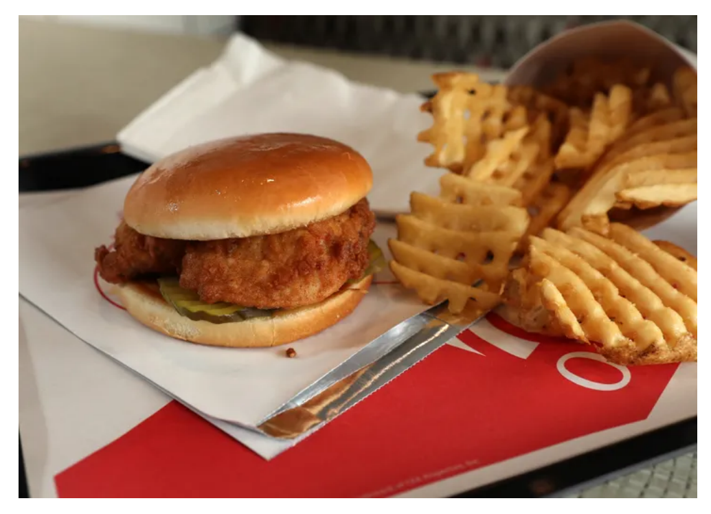
Chick-fil-A is closed on Sundays in a nod to its Christian roots.

"Modeling care for others starts in the restaurant, and we are committed to ensuring mutual respect, understanding and dignity everywhere we do business," he continued. "These tenets are good business practice and crucial to fulfilling our Corporate Purpose."