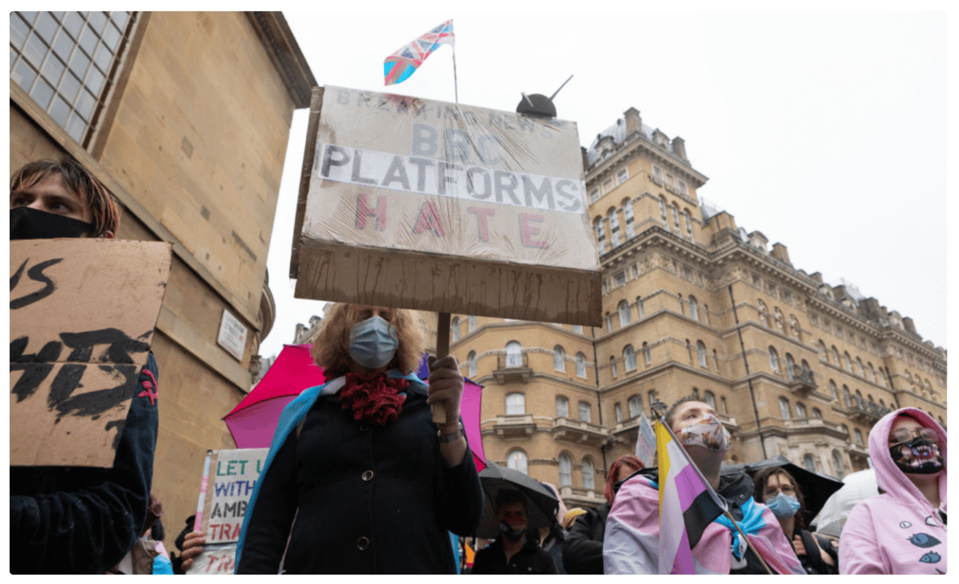
The BBC has been called out for being "institutionally transphobic" and posting anti-trans articles in the past.

The article also included an interview with Lily Cade, an openly anti-trans former porn performer and director who had been accused by multiple women of sexual assault. Cade was eventually removed from the article after posting blogs calling for the "lynching" and "execution" of trans women.