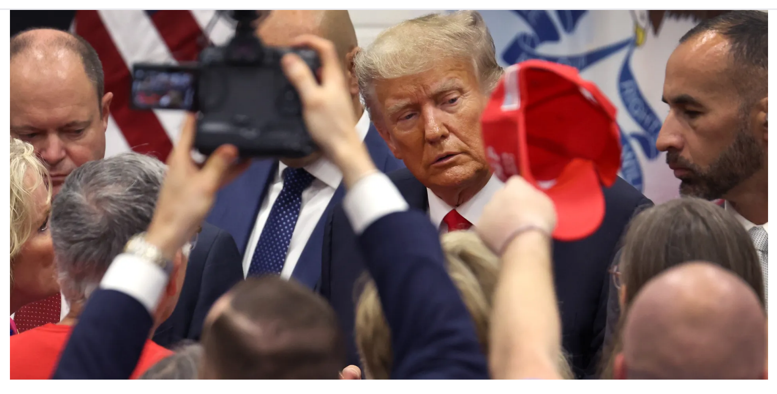
Former President Donald Trump greets supporters on June 1 at a Team Trump volunteer leadership training event in Grimes, lowa, after giving an unscripted speech.

Former President Trump has <u>been indicted twice</u> — and faces potential criminal convictions — but he's not barred from running for or assuming presidential office.