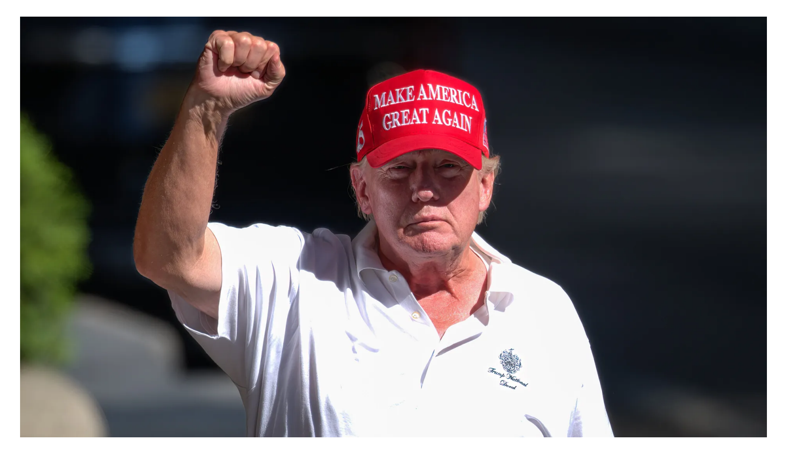
Former President Trump arrives at Trump Tower in New York City in May.

For Donald Trump, the 2024 campaign is more than a race to return to the White House - it's a fight to stay out of prison.