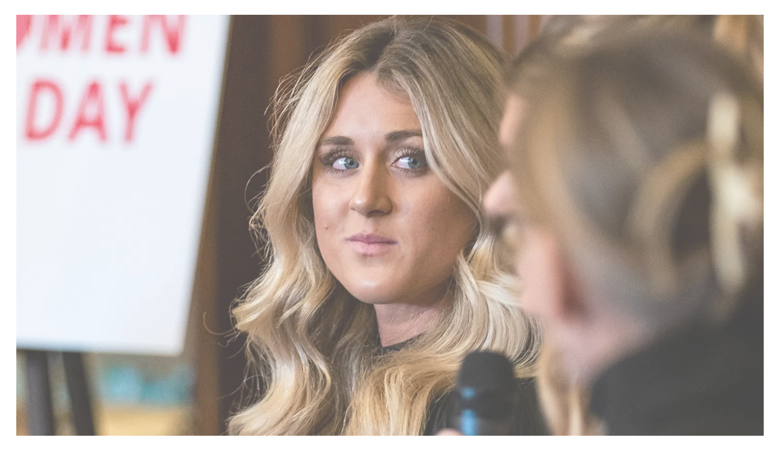
Riley Gaines speaks during a discussion on transgender athletes In women's sports during a National Girls and Women in Sports day event on Capitol Hill on Tuesday, Feb. 01, 2023, in Washington, D.C.