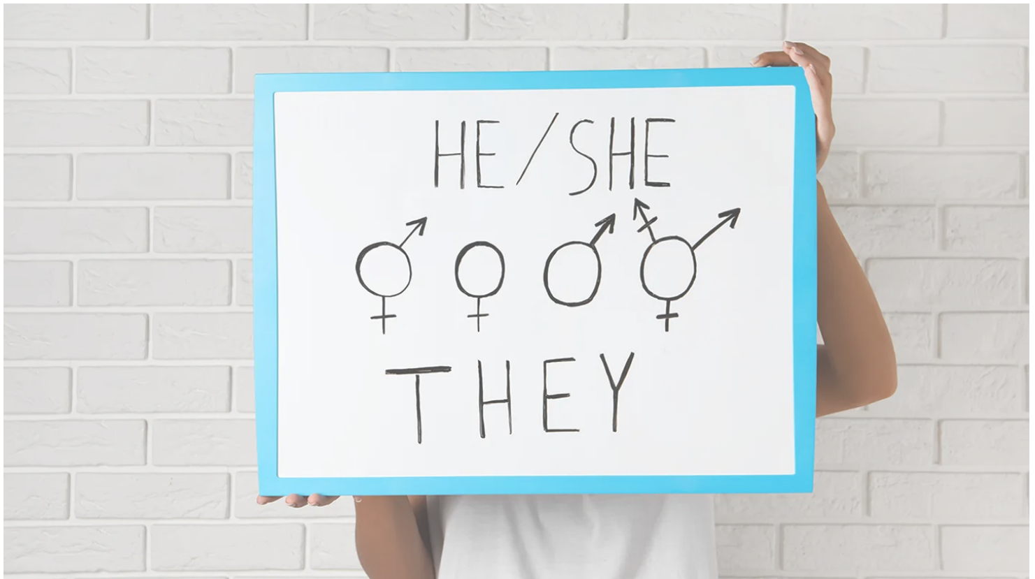
Woman holding sign with gender pronouns and symbols near white brick wall

Another parent, a mother, stood at the podium and voiced her concerns about the policy as well.