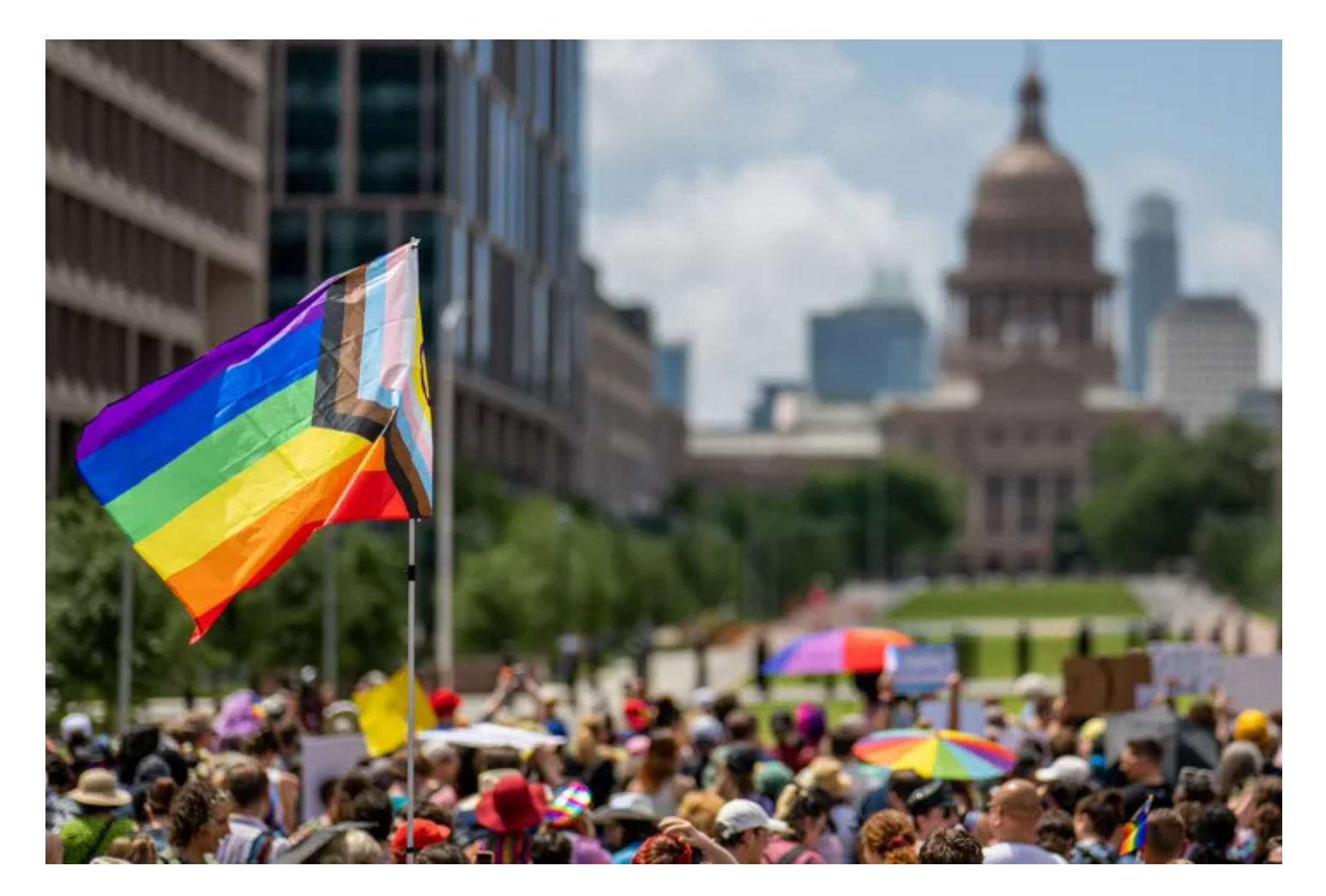
Texas would expand what is considered an illegal public performance of sexual conduct, under a bill approved late Sunday by state lawmakers that drag artists fear will be used to criminalize their shows.

Violators could face up to a year in jail, and businesses hosting performances deemed illegal could be fined $10,000 for each violation.