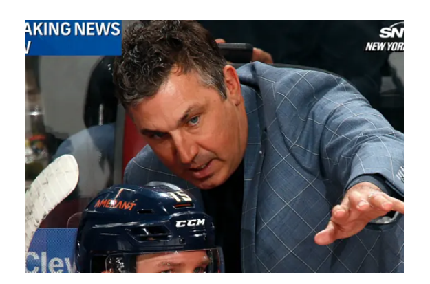
Breaking News Now: Predators choose Devils associate as new head coach