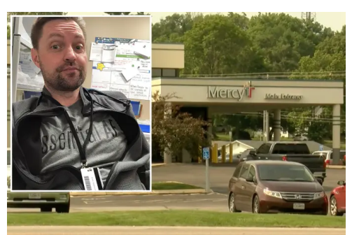
Hospital alerted cops after missing ER doctor skipped first shift without notice in 15 years