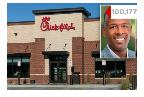
Chick-fil-A sparks anti-woke outrage over VP of diversity, equity, inclusion post

Bud Light sales have been in freefall since