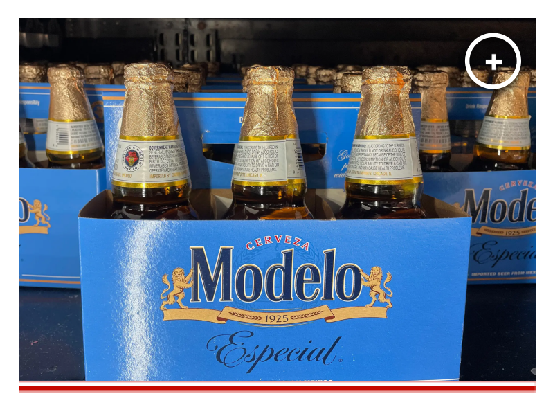
Modelo, the second largest beer brand in the US is closing gap with the top-selling brand, Bud Light.

Anheuser-Busch InBev owns both brands, but it does not control Modelo in the US, where it is owned by New York-based conglomerate Constellation Brands.