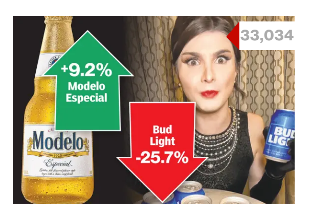
Bud Light losing status as top-selling beer as Modelo closes gap after sales plunge